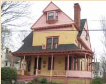
The George Nasin House 159 North Street Circa 1894