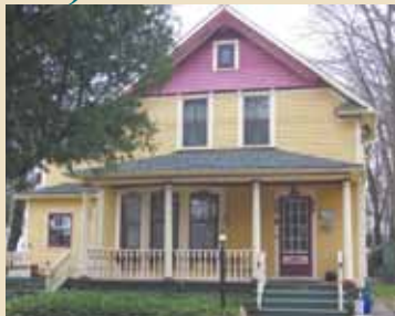
The Albert Morse House 202 Lewiston Street Circa 1890