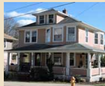
The Herbert G. Bentley House 36 Lewiston Avenue Circa 1923