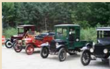
The Four Seasons Model T Car Club will drive throughout the Prospect Hill neighborhood. Weather Permitting.