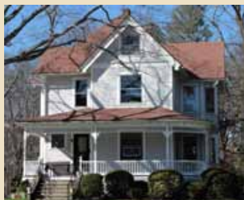
The Joseph B. Riordan House 305 Prospect Street Circa 1899