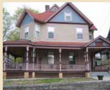
The Fred D. Jordan House 130 North Street Circa 1890