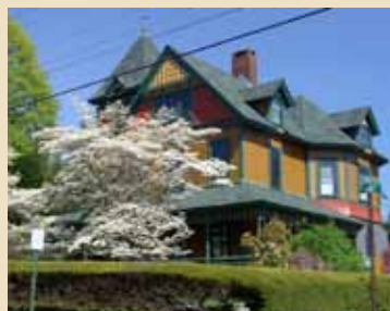
The Joseph Dwight Chaffee House 183 Summit Street Circa 1889